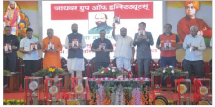
Foundation day of Jadhvar group of institute