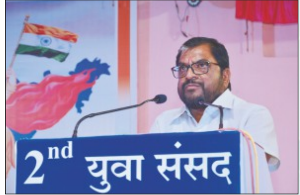
Shri Raju Shetty (MP, President - Farmers Swabhiman Association)