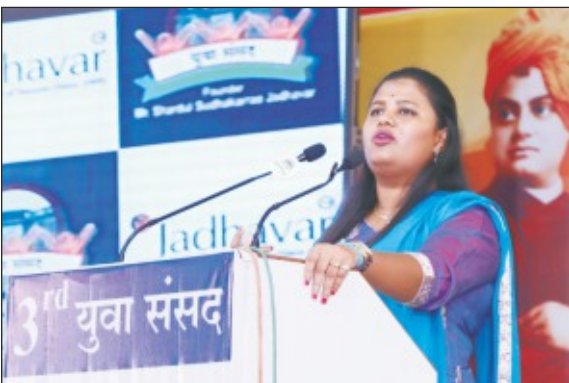
Smt. Dr. Hina Gavit (MP Maharashtra)