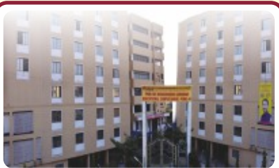
Prin.Dr. Sudhakarrrao Jadhavar Educational Campus (1), Narhe, Pune-41

Phone - 7888274117 www.paradiseems.co.in / www.jadhavarems.in / www.jadhavarsemienglish.in