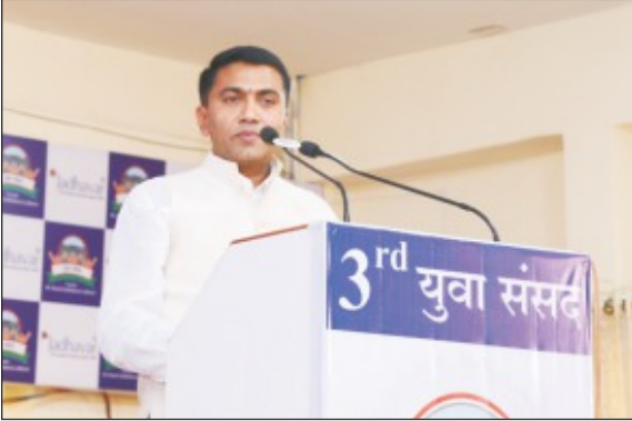
Mr. Dr. Pramod Sawant (Chief Minister of Goa)