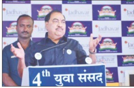
Mr. Eknath Khadse (Former Revenue Minister, Maharashtra)