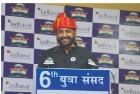
Mr. Imtiaz Jalil (MP, Maharashtra)