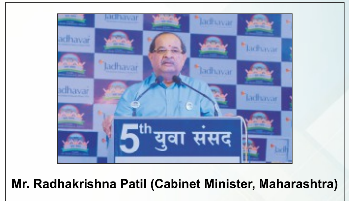
Mr. Radhakrishna Patil (Cabinet Minister, Maharashtra)