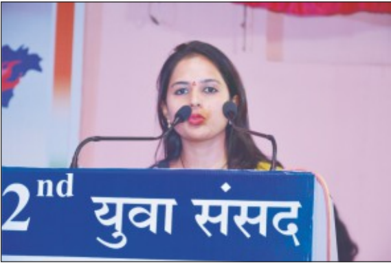
Smt. Pritam Tai Munde (MP, Maharashtra)