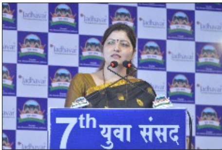
Smt. Rupalitai Chakankar (President-Maharashtra Rajya Mahila Ayog State Minister)