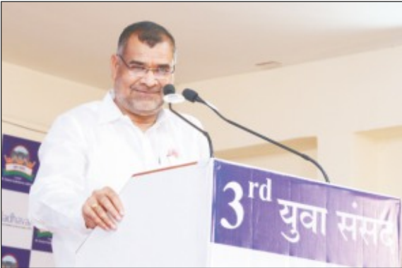
Mr. Sadabhau Khot (Minister of State, Maharashtra)