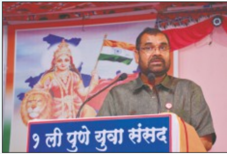
Mr. Sadabhau Khot (Minister of State, Maharashtra)