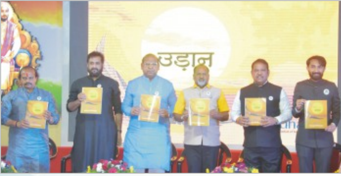
Udaan - Book inauguration at 5th Yuva Sansad