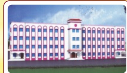
Adv. Shardul Sudhakarrrao Jadhavar Educational Campus (2), Narhe, Pune - 41

Surekhatai Sudhakarrrao Jadhavar Educational Campus (3), Vadgaon Bk, Pune-41.