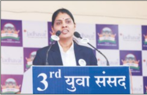
Smt Lalita Babar (Asia's Best Runner)