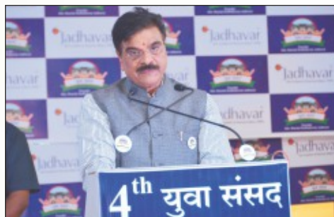
Mr. Vijaybapu Shivtare (Minister of State, Maharashtra)