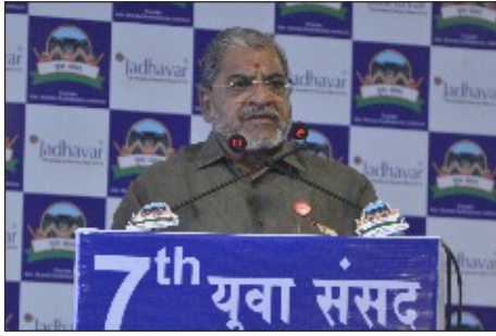
Hon. Raju Shetti (Organization Founded-Swabhimani Paksha)