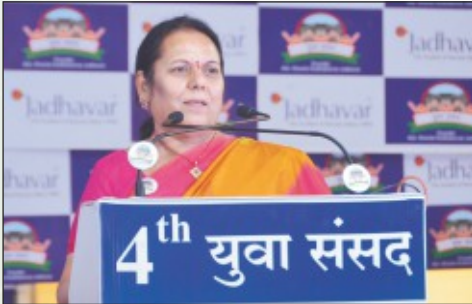
Smt. Neelam Tai Gore (Deputy Speaker, Legislative Council)