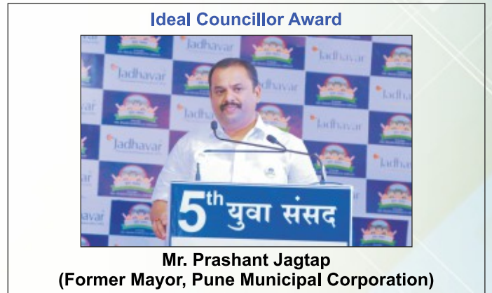
Mr. Prashant Jagtap (Former Mayor, Pune Municipal Corporation)