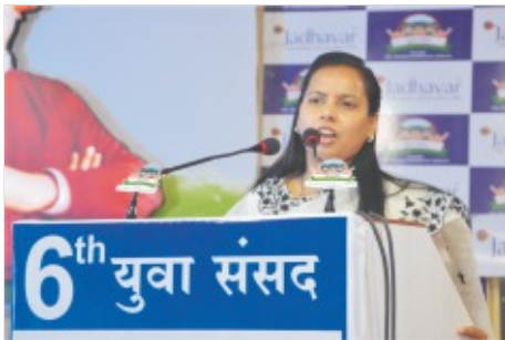
Smt. Aditi Tatkare (Cabinet Minister, Maharashtra)