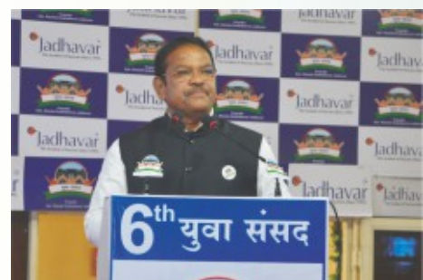
Mr. Srirang Barane (MP, Maharashtra)