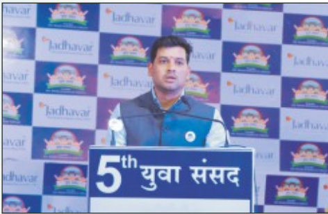
Mr. Shrikant Shinde (MP, Maharashtra)