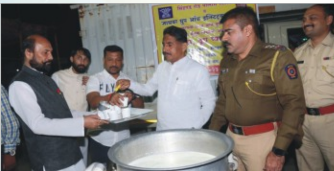
Daru soda Dhood Pya Abhiyan