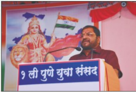
Shri Raju Shetty (MP, President - Farmers Swabhiman Association)