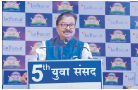
Mr. Gajanan Kirtikar (MP, Maharashtra)