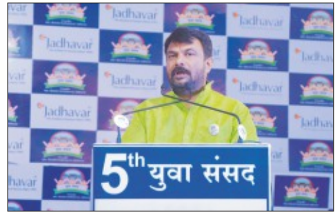
Mr. Hemant Patil (MP, Maharashtra)