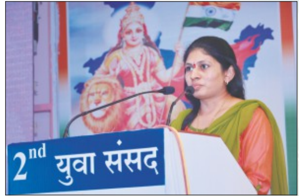
Smt. Rakshatai Khadse (MP, Maharashtra)