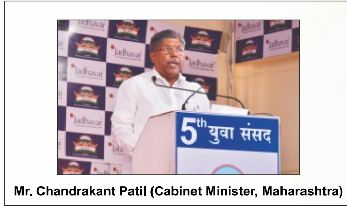
Mr. Chandrakant Patil (Cabinet Minister, Maharashtra)