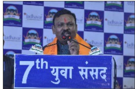
Mr. Ashok Nete (Member of Lok Sabha)