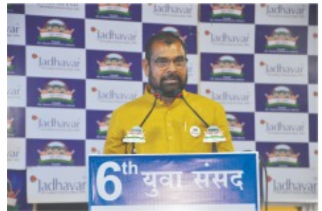
Mr. Sada Khot (Former Minister of State, Maharashtra)