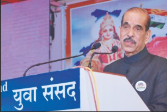
Shri Manohar Rao Joshi Sir (Former Chief Minister - Maharashtra, Former Speaker - Lok Sabha)