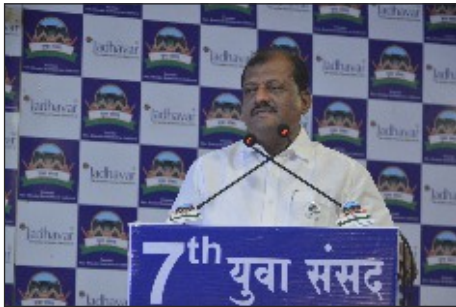
Mr. Sanjay Jadhav (Member of Lok Sabha)