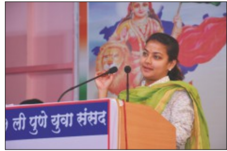
Smt. Praniti Tai Shinde (MLA, Maharashtra)