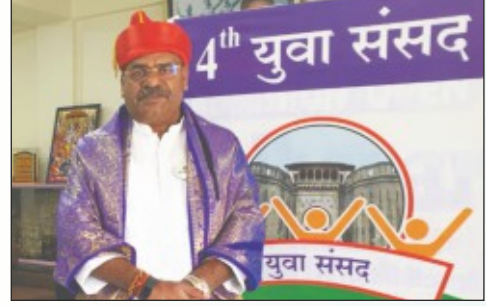
Mr. Shivajirao Adarrao Patil (MP, Maharashtra)