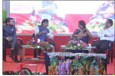
Mr. Sanjay Raut (Member of Rajyasabha) Smt. Sushmatai Andhare (Shivsena Spokesperson)