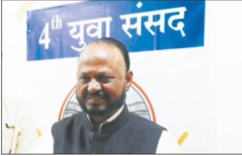
Mr. Anandrao Adsul (MP, Maharashtra)